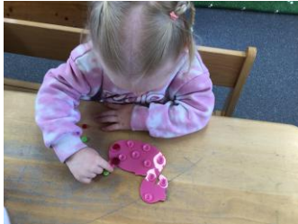
Hazel (Reception – Year 2)

Forest school was onsite due to the weather forecast restricting us from going into the woods.